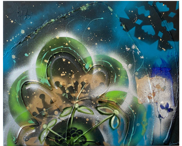
Rainbow's End , acrylic, oil paint and mixed media on canvas, 20x24 inches